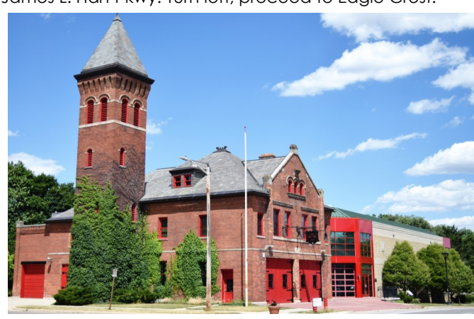
MICHIGAN FIREHOUSE MUSEUM & EDUCATION CENTER

I-94 Exit 183, take Huron St. south to the traffic light at James L. Hart Pkwy. Turn left, proceed to Eagle Crest.